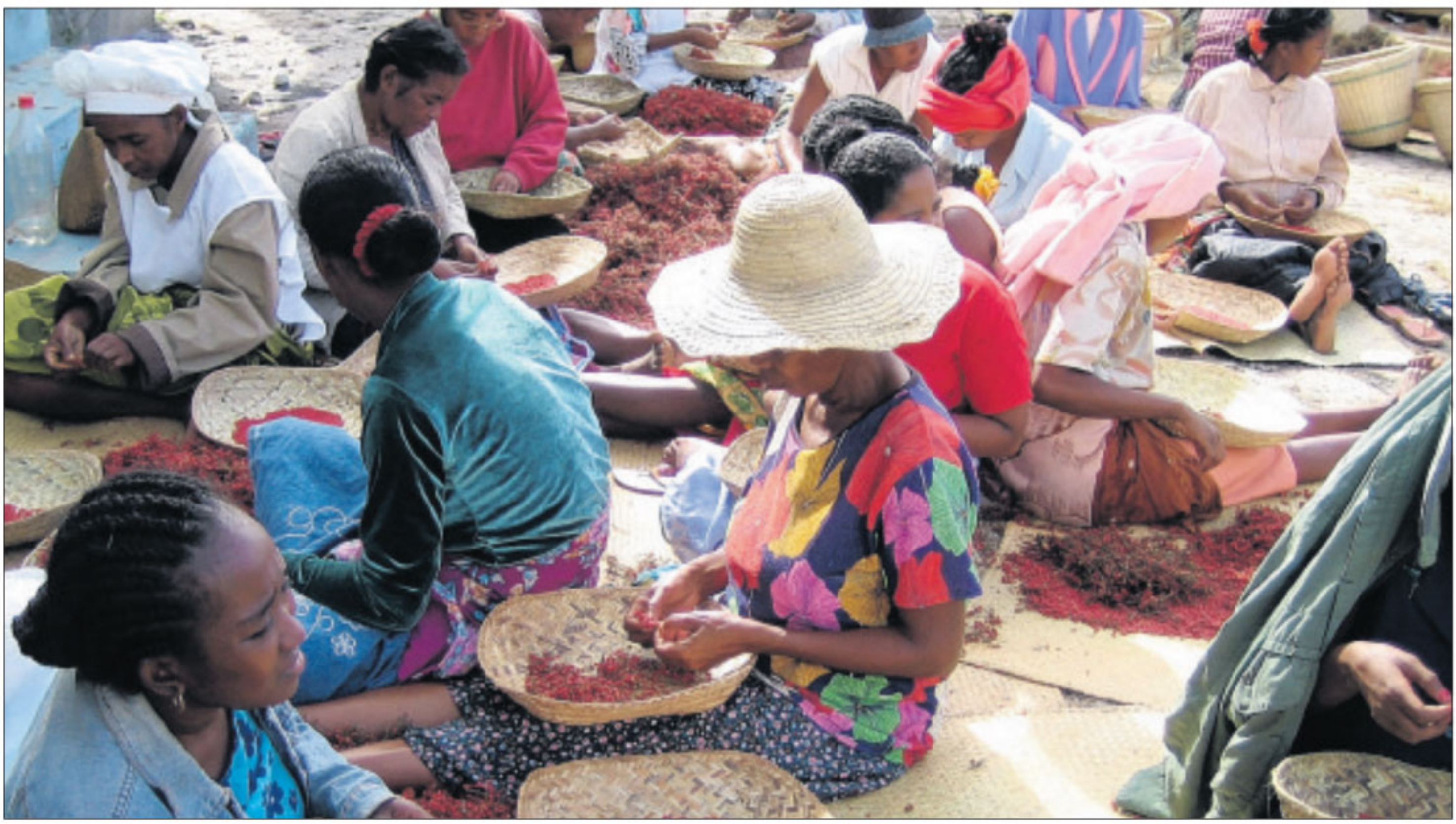
Food for thought: Traders sort red peppercorns at one of the island's many vibrant markets

size of their camera lenses. But don't let this put you off. Leaving the capital behind, the RN7 leads us first to Perinet National Park – lemur territory. Our guide, Pascale, hops around snaking tree roots and razor-sharp palms to bring us face to face with the rare primates, native to Madagascar. The diademed sifaka is a caricature of an orangutan and the indri look like skinny panda bears. But the bamboo lemur (left) is the sweetest – a nervous little grey furball with imploring eyes. Adorable.