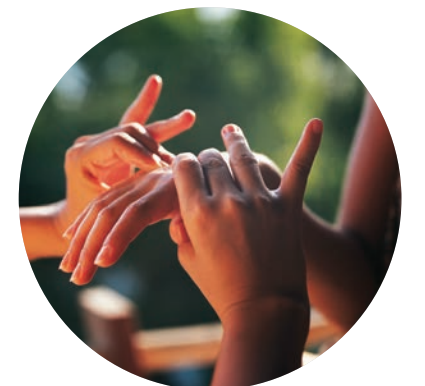
TOP: Sound bath therapy MIDDLE: Meditation room BOTTOM: Hand massage FACING PAGE: Living area of a suite at Vana Retreat