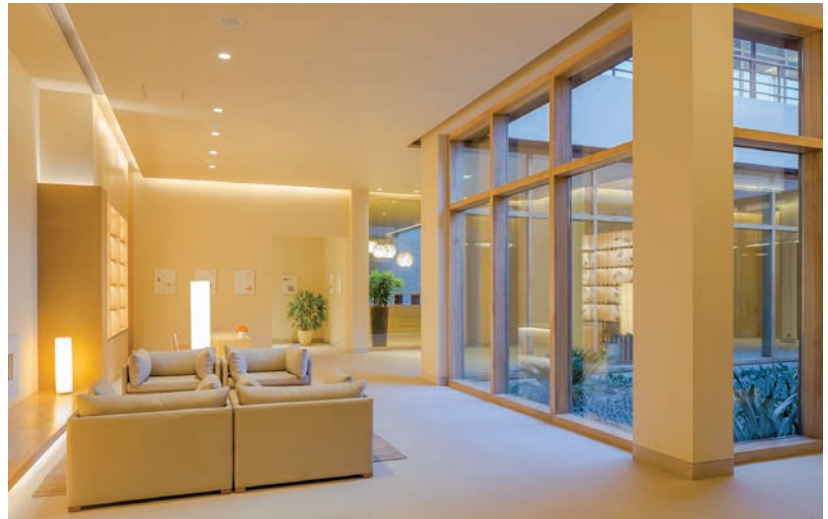
Vana, in Dehradun, India, offers the next level of wellness and is a trailblazer in the spa world

in the real world. Of course Thailand continues its reign as the place to balance body, soul and mind, while closer to home, 'holidays for health' are proliferating in Austrian resorts such as Hotel Adler Balance and Ayurveda Resort Sonnhof, both of which are centres of wellness excellence.